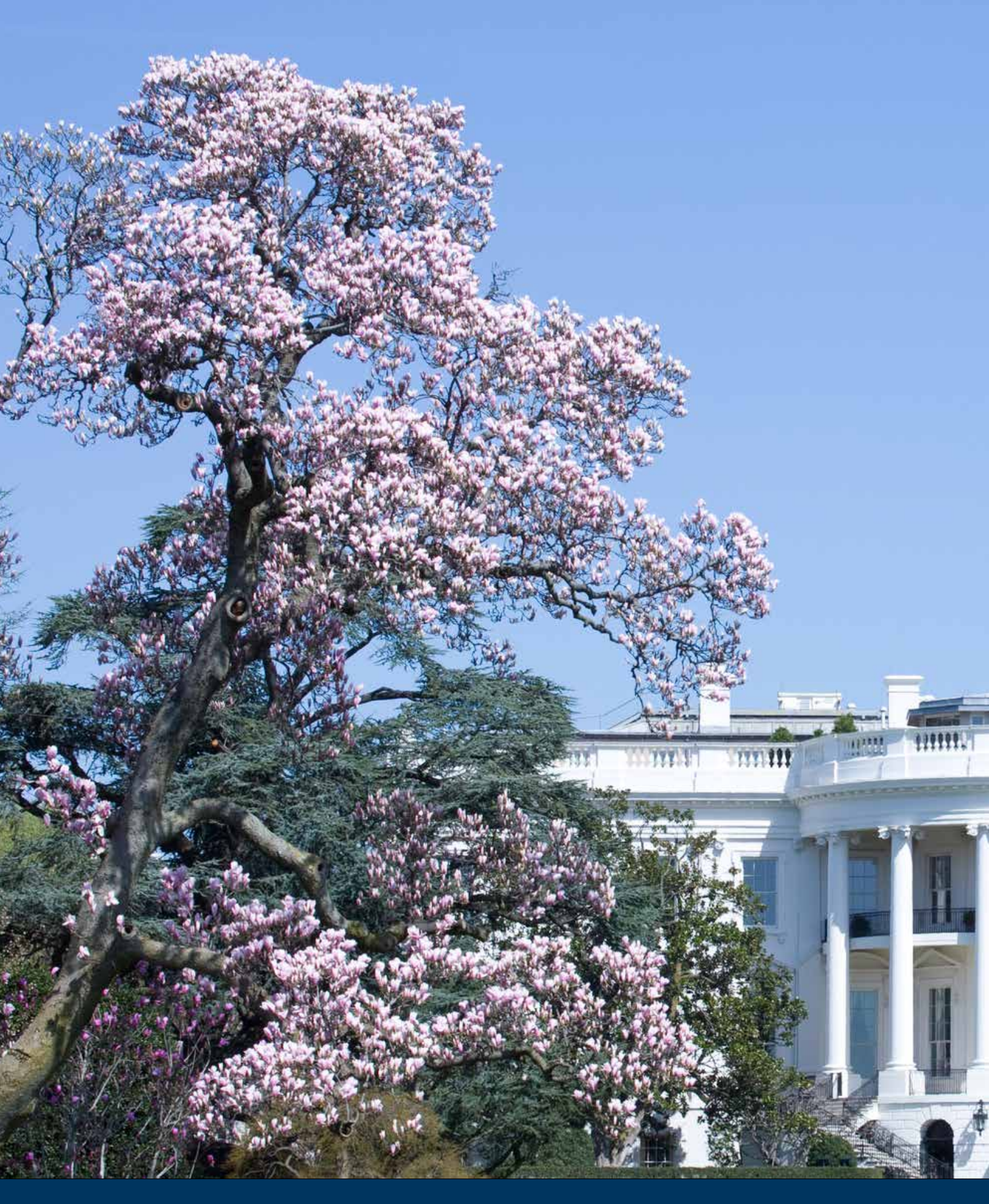
U.S. Department of Commerce | International Trade Administration | Global Markets | 2