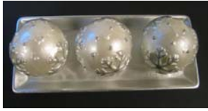
SCO2-319 Snowflake Candle [Top]