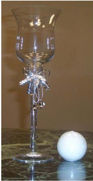
SCO2-325 Candle Beside Clear Glass