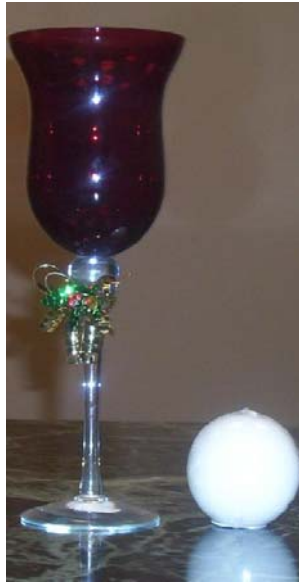
SCO2-325 Candle Beside Red Glass