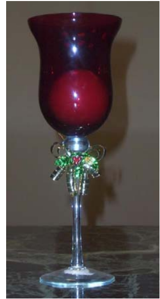
SCO2-325 Candle In Red Glass