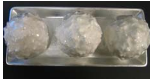
SCO2-320 Snowball Candle [Top]