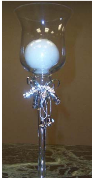
SCO2-325 Candle In Clear Glass