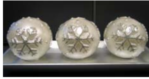
SCO2-319 Snowflake Candle [Front]