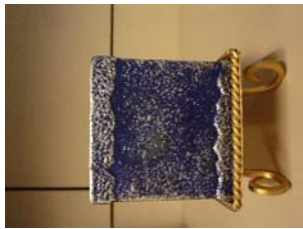
Christmas Joy 4