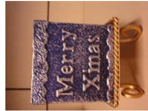
Christmas Joy 3