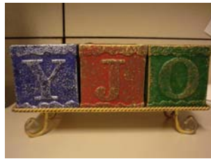
Christmas Joy 5