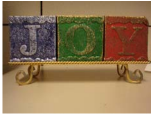
Christmas Joy 1