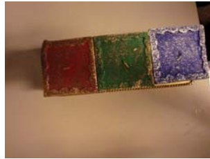
Christmas Joy 2