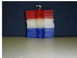
Stacked Star Side