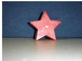
Stacked Star Top