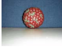
Cranberry Candle Top View