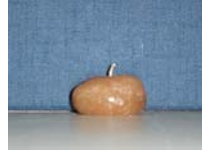
Stone Candle Side View