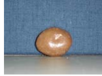
Stone Candle Side View