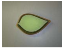
Cucumber Mint Candle In Holder