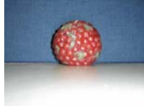
Cranberry Candle Side View