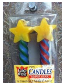
Super Star Candles