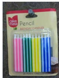
Pencil Birthday Candles