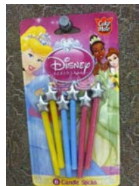
Magic Wand Candles