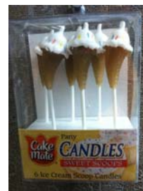
Sweet Scoop Candles