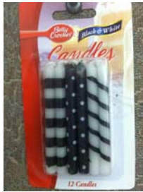
Black and White Candles