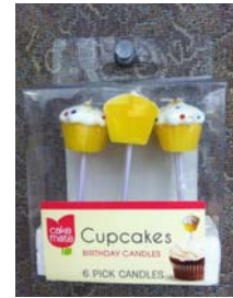
Cupcake Birthday Candles