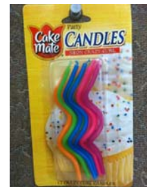
Neon Crazy Curl Candles