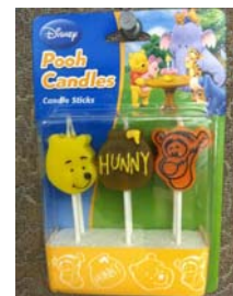
Winnie the Pooh Candles