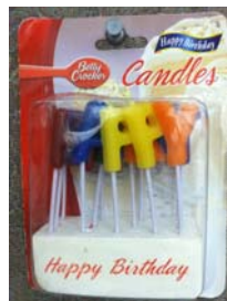
Happy Birthday Candles