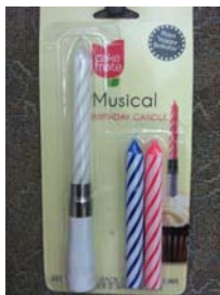
Party Musical Birthday Candles