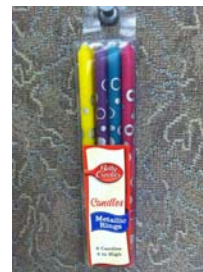
Metallic Rings Candles