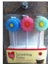
Sparkling Daisy Birthday Candles