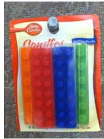
Building Block Candle (Thick and Thin models)