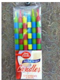
Stacked Stripes Candles