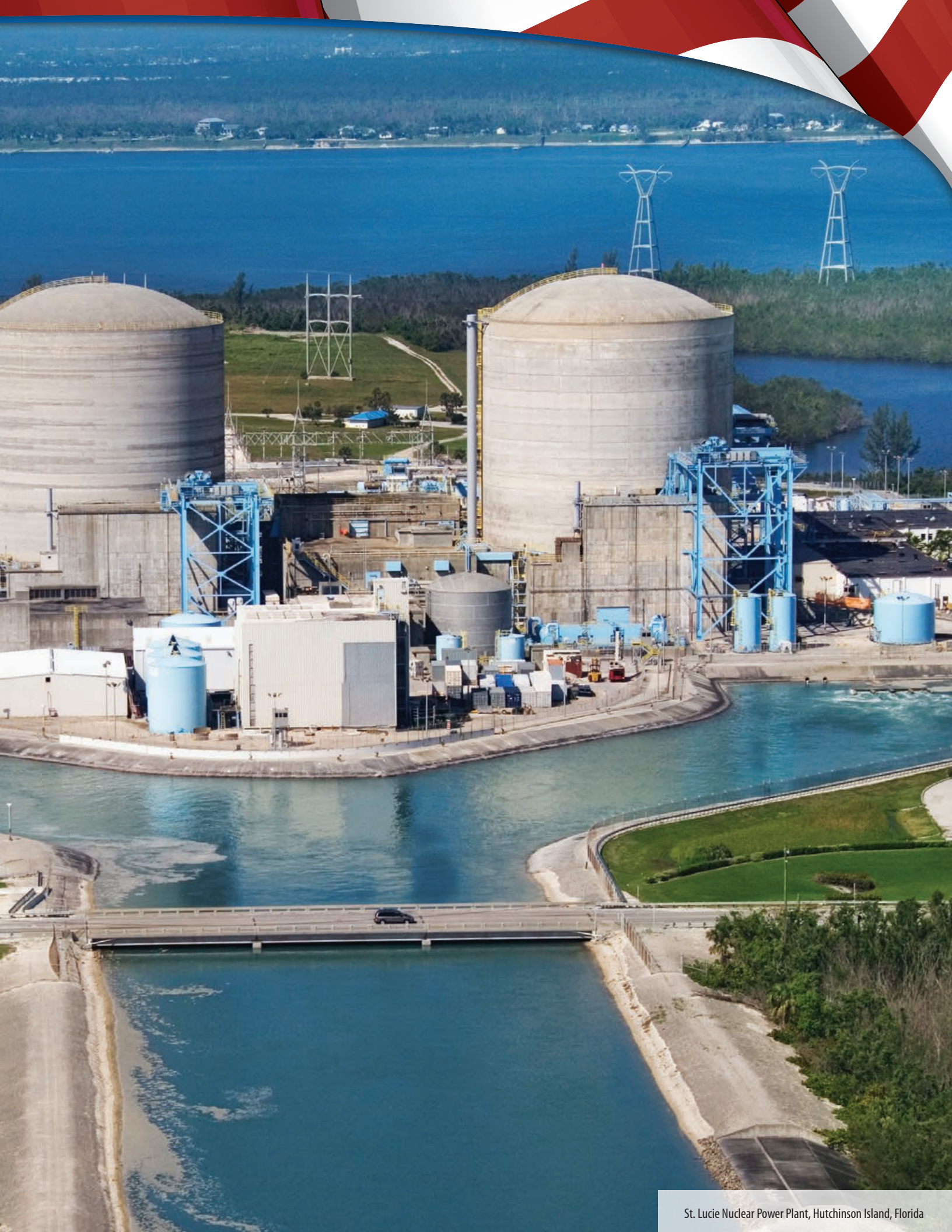
St. Lucie Nuclear Power Plant, Hutchinson Island, Florida