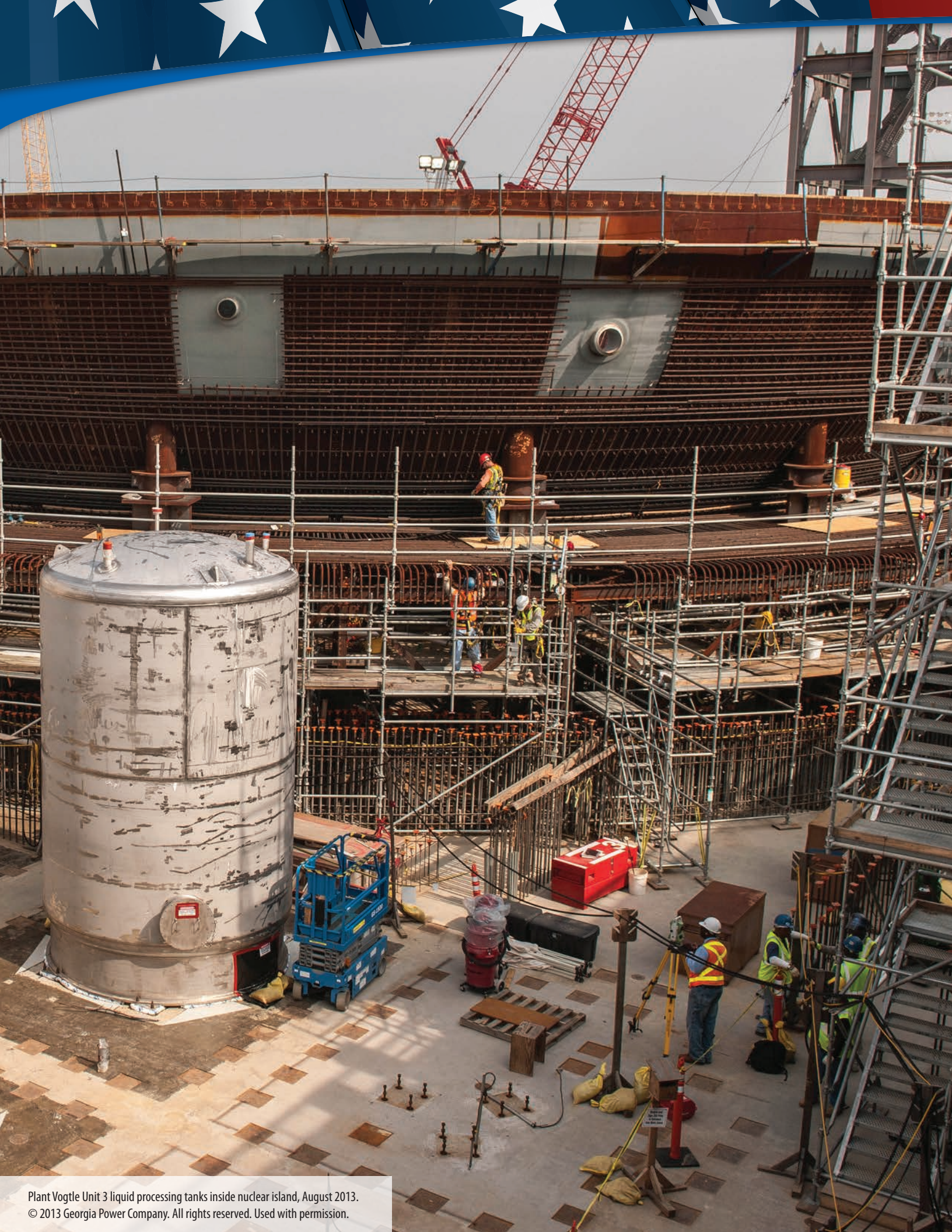
Plant Vogtle Unit 3 liquid processing tanks inside nuclear island, August 2013.