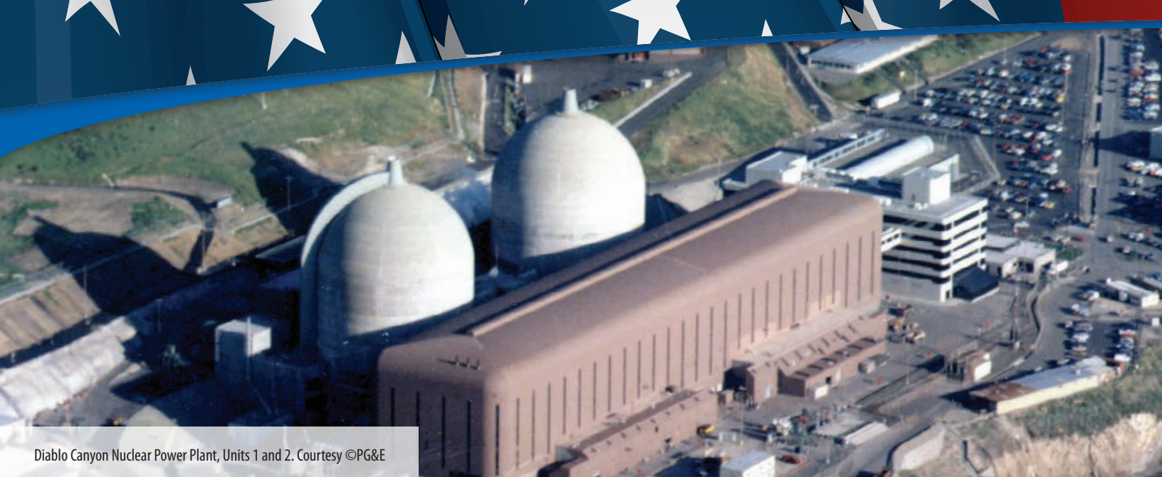
Diablo Canyon Nuclear Power Plant, Units 1 and 2.

trade promotion events, and commercial diplomacy designed to help U.S. companies succeed.