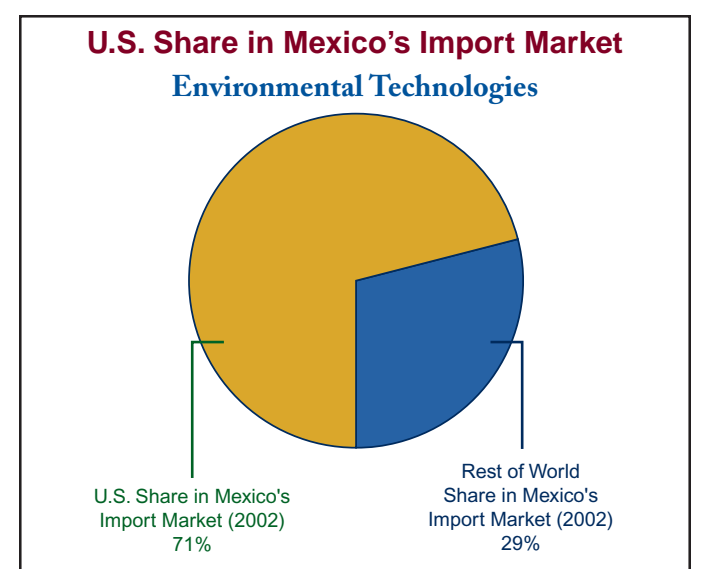
In 2002, U.S. firms captured 71% of Mexico's environmental technologies import market and 70% of Canada's environmental technologies import market.

management. Closer economic integration and cooperation since the passage of NAFTA have had a beneficial effect on Mexico's environmental capacity including the enhanced ability to analyze and protect its own resources. Today, Mexico invests more money in the environmental technology sector than any other Latin American country, except Brazil.