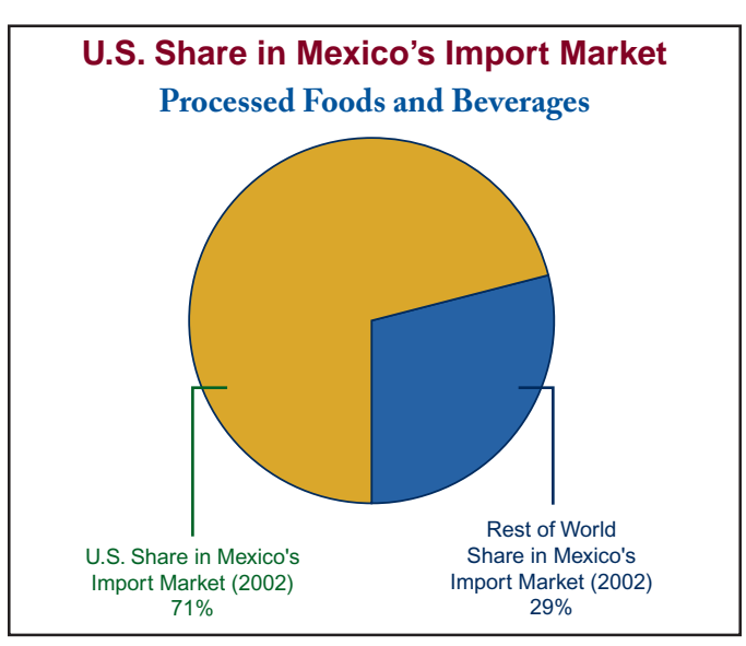
In 2002, U.S. firms captured 71.4% of Mexico's processed foods and beverages import market and 67% of Canada's processed foods and beverages import market.