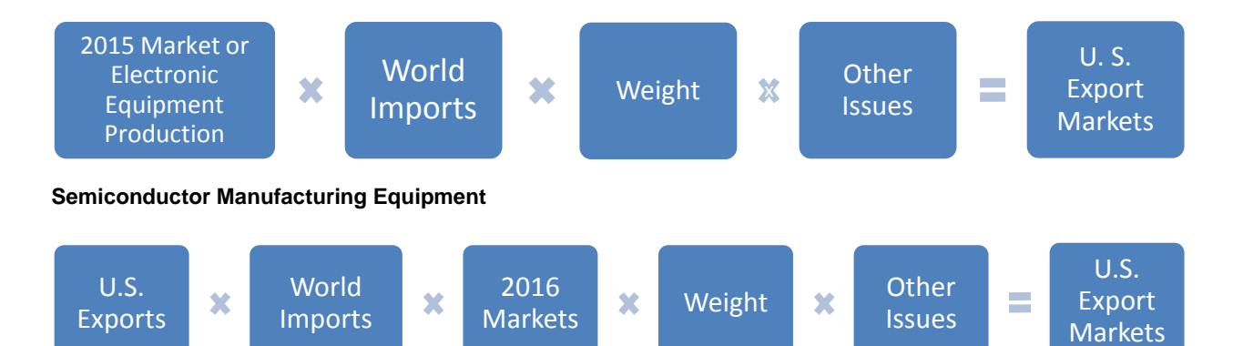
Figure 5: Methodology for Ranking Markets Semiconductors

2016 and to project exports in the future. This is relatively straightforward for semiconductor manufacturing equipment. It was difficult in the case of semiconductors, however, due to overseas packaging and final assembly of semiconductors and transshipments skewing the import and export data.